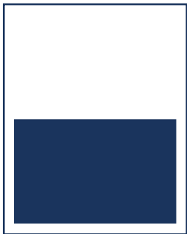
1/2 page horizontal 7.5" x 4.875"