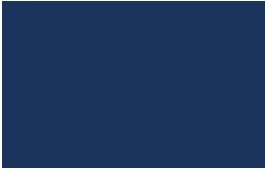
2 Page Spread Full Bleed 17" x 11.125"